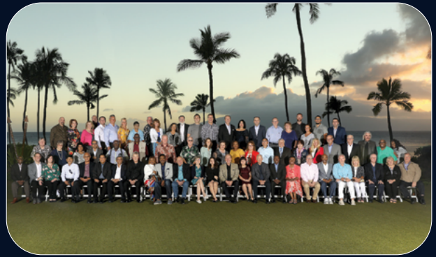
Global Church Network Worldwide CoChairs

FINISH 2030 is about taking the Gospel to the hardest places in the world. Several years ago, I was fortunate to cohost a Middle East Summit made up of 229 Christian leaders from every nation in that region. We were humbled to have pastors and leaders join us from Iran, Iraq, Syria, Kuwait, Saudi Arabia, Israel, Jordan, Egypt, Libya, Turkey, Armenia, UAE, Qatar, Lebanon, Yemen, Oman, Bahrain, Cyprus, Azerbaijan, Afghanistan and Kazakhstan.